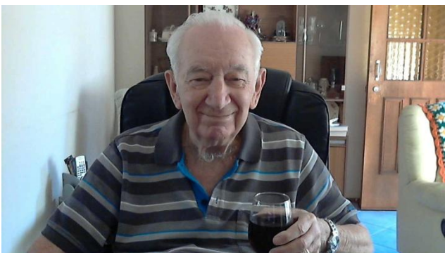
At my computer concentrating on putting the Newsletter together.