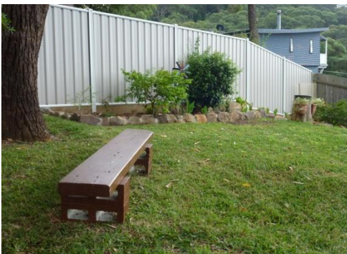
Photo shows a small section of yard works my wife and I have done since the Corona Virus restrictions have been in place. The new fence was already installed, and we took the opportunity to construct the rock garden, features and garden bench. She would like an additional feature, but it will have to wait until the shed reopens. In addition we have carried out those home maintenance jobs that were previously on the back burner.

Dave helped me trace electrical gremlins that surfaced in the house, I've delivered a few bags of recyclables to Merv, and I've spoken with the few members whose contact details I've got.