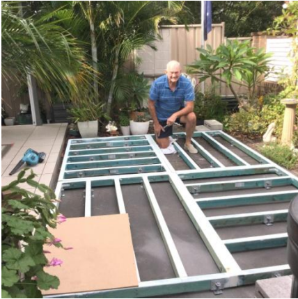
Progressive of decking in our courtyard